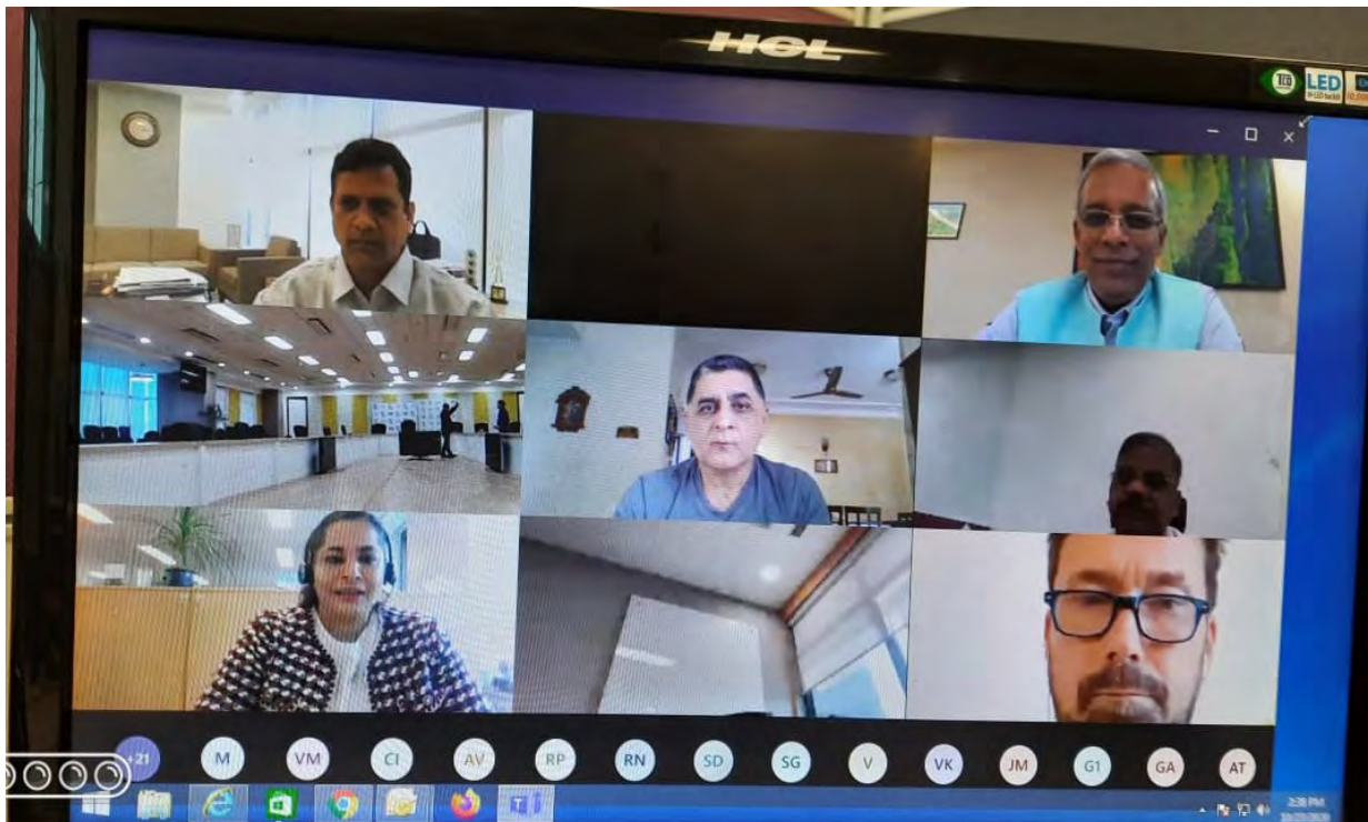
Webinar held on 27.10.2020