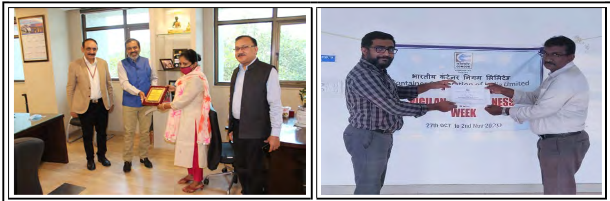
Presentation of Award (Most Vigilant Employee of the Year 2019-20)