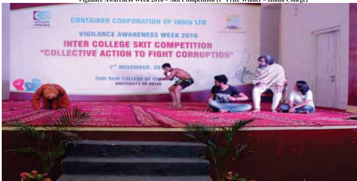
Vigilance Awareness Week 2016 – Skit Competition (Still from the performance of Atma Ram Sanatan Dharm College)