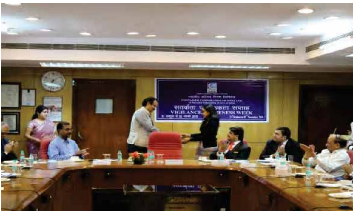
Vigilance Awareness Week 2016 – Presentation of Award (Essay Writing Competition)