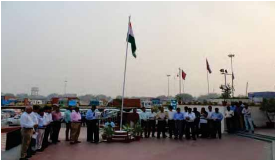
Vigilance Awareness Week 2016 – Integrity Pledge administered by CVO/CONCOR at ICD, Tughlakabad, New Delhi

In pursuance to instructions by CVC, an Integrity Pledge was administered by CVO to stakeholders at CONCOR's flagship terminal located at Inland Container Depot, Tughlakabad, New Delhi on 31 st October, 2016.