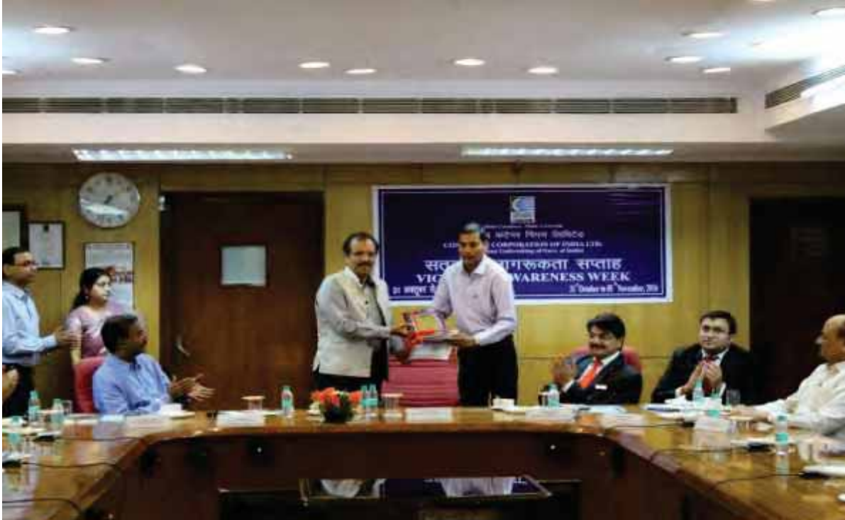
Vigilance Awareness Week 2016 – Presentation of Award (Most Vigilant Employee of the Year 2015-16)