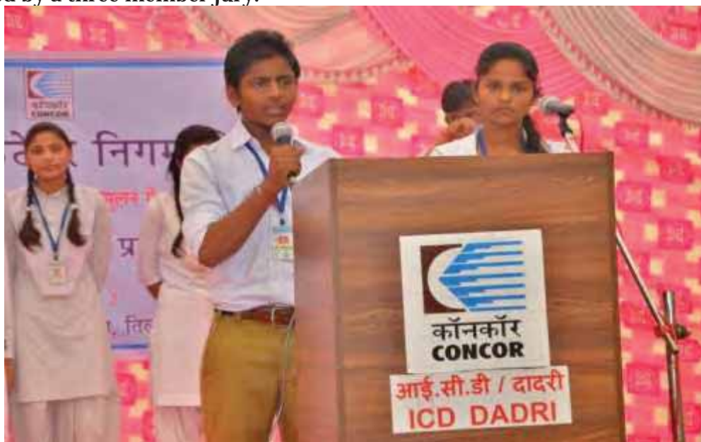
Debate competition organized by NCR Office/CONCOR at Bhartiya Adarsh Inter-College (School), Tillapta, G.B. Nagar, Dadri

A debate competition was organized by CONCOR's North Central Regional Office at Bhartiya Adarsh Inter-College (School), Tillapta, G.B. Nagar, Dadri on 5 th November, 2016. Eight students of the School participated in the competition and the topic was "Public participation in promoting Integrity and eradicating Corruption". The winners were selected by a three member jury.