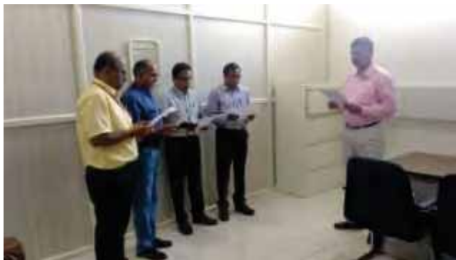
Photograph of pledge taking ceremony at CONCOR Air Ltd.

M/s. Fresh & Healthy Enterprises Ltd (FHEL) and M/s. CONCOR Air Ltd observed Vigilance Awareness Week by taking pledge, displaying banners and through interactive sessions among the employees & customers.