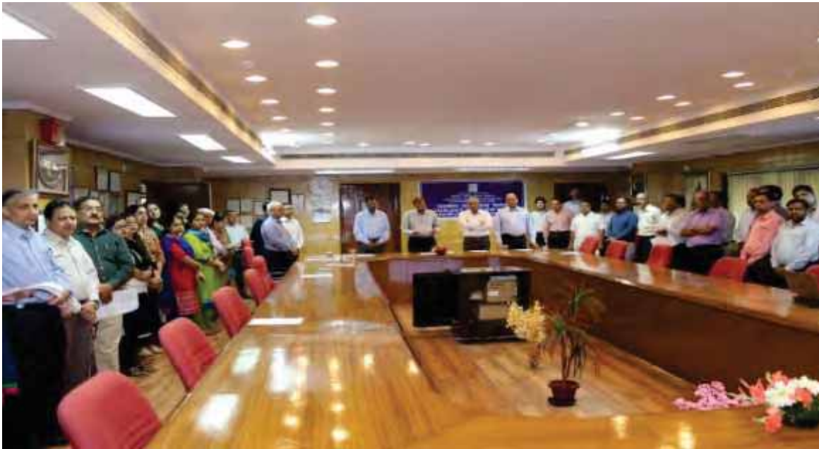
Vigilance Awareness Week 2016 - Pledge taken by officials of/CONCOR

In pursuance to instructions by CVC, an Integrity Pledge was administered by CVO to stakeholders at CONCOR's flagship terminal located at Inland Container Depot, Tughlakabad, New Delhi on 31 st October, 2016.