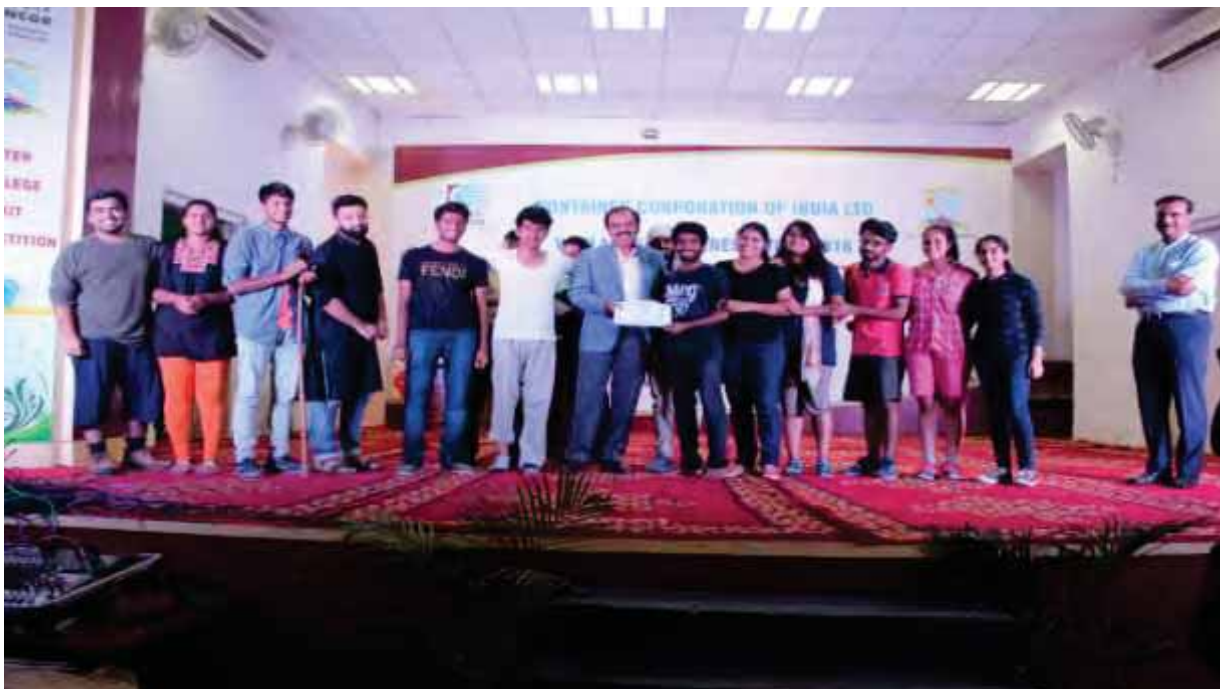
Vigilance Awareness Week 2016 – Skit Competition (3 rd Prize Winner – Ram Lal Anand College)

The event has been widely covered in print and electronic media. Press clippings are enclosed as Annexure-I.