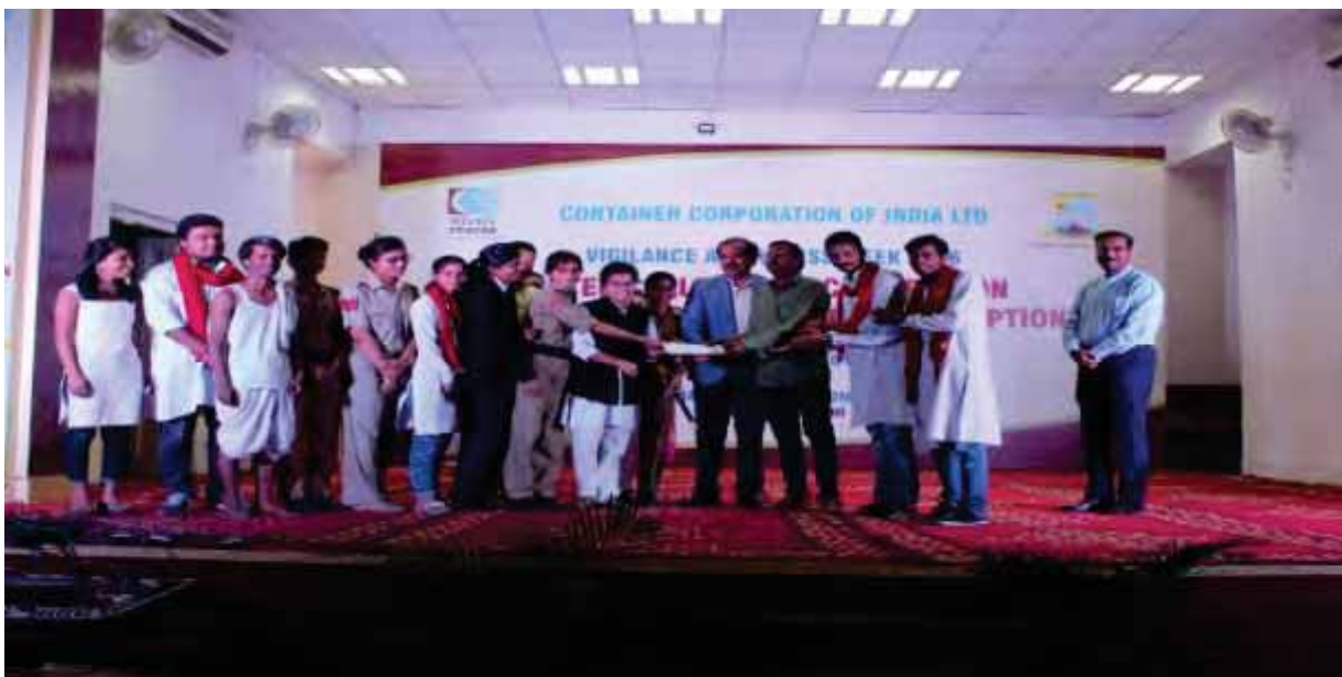
Vigilance Awareness Week 2016 – Skit Competition (1 st Prize Winner – Hindu College)