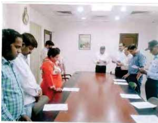
Photograph of pledge taking ceremony at FHEL