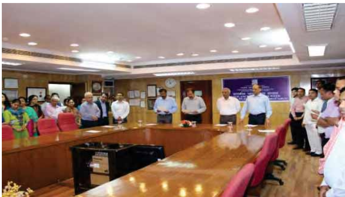
Vigilance Awareness Week 2016 - Pledge administered by Shri V. Kalyana Rama, CMD/CONCOR