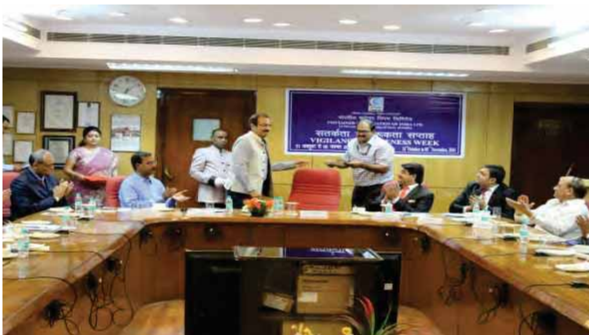
Vigilance Awareness Week 2016 – Presentation of Award (Essay Writing Competition)